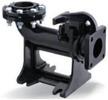
Kızak Ray Sistemi