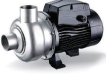
Açık Fanlı Paslanmaz Santrifüj Pompa