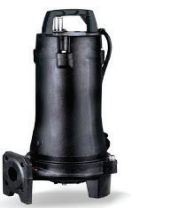
Parçalayıcı Bıçaklı Pis Su Pompası