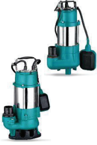
Paslanmaz Gövdeli Fosseptik Pompası