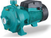
Kademeli Santrifüj Pompa