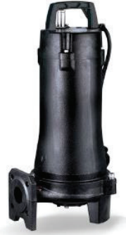
Açık Fanlı Pis Su Pompası