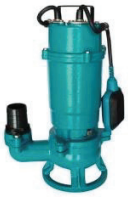
Döküm Gövdeli Fosseptik Pompası