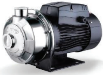
Paslanmaz Açık Fanlı Santrifüj Pompa