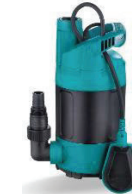
Çift Çıkışlı Flatörlü Plastik Drenaj Pompası