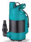
Çift Çıkışlı Sensörlü Plastik Drenaj Pompası