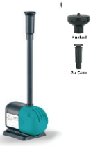
Fiskiyeli Havuz Pompası