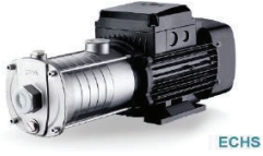
Paslanmaz Kademeli Santrifüj Pompa