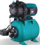
Domestik Paslanmaz Hidrofor Seti