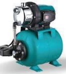
Domestik Paslanmaz Hidrofor Seti