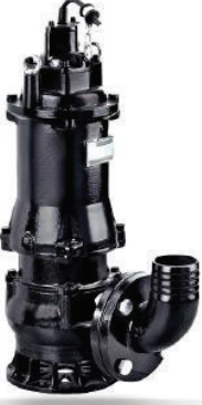
WQ(D)0.75 – 7.5 kW

Tıkanmayı önleyen iki kanatlı pervane, bütün aralığı boyunca büyük miktarda katı madde pompalayabilir. Krom kaplama şaft yüksek derecede korozyon ve aşınma direnci sağlar. Isı koruması ile birlikte 4Kw'den az güç tüketimi. Lağım suyu, atık su, yağmur suyu ve katı tahlil, çeşitli kumaşlar, çamur ve katı atıklar barındıran suyun pompalanması için tasarlanmıştır.