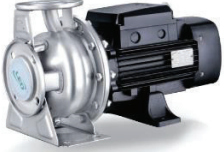
Paslanmaz Monoblok Santrifüj Pompa