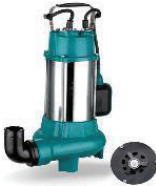
Parçalayıcı Bıçaklı Fosseptik Pompası