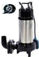
Parçalayıcı Bıçaklı Fosseptik Pompası