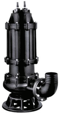
WQ 11 – 45 kW