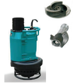
Dalgıç Çamur Pompa