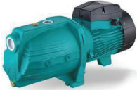
Döküm Jet Pompa