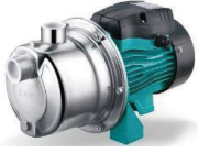
Paslanmaz Jet Pompa