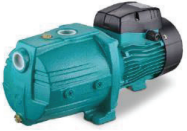
Kademeli Jet Pompa