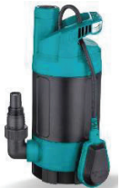
Çift Çıkışlı Flatörlü Plastik Drenaj Pompası