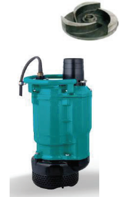
Dalgıç Drenaj Pompa